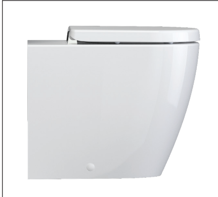
Pictured with Caroma Arc soft close seat

Combining universal design with rimless pan technology, the Forma Cleanflush™ is a superior flushing system suitable for domestic and commercial applications. Incorporating several patented technologies: Caroma Flow Splitter™, Caroma Flow Balancer™ and Caroma Uni-Orbital® Connector, the Cleanflush pan is innovative and the next evolution in toilets. The Flow Splitter evenly flows water around the top of the bowl to meet at the Flow Balancer which directs the water powerfully into the sump, reducing the need for brush cleaning. The rimless pan is easy to clean and unlike traditional pan profiles, provides full visibility of any grime build up. Caroma Cleanflush provides a cleaner clean for peace of mind.